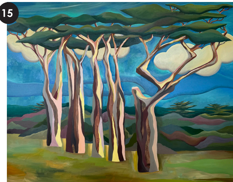
'Sentinels on Spring' | 152 x 123cm | $3000