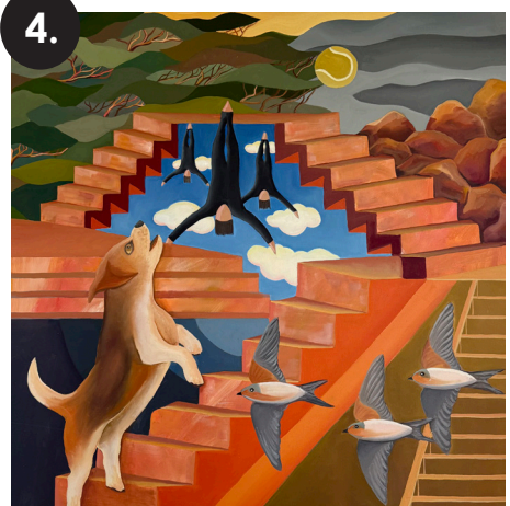
'Decending' | 91 x 91cm | $1500