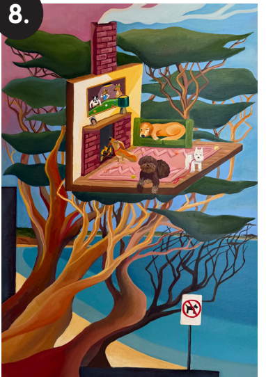
'No dogs allowed' | 51 x 76cm | $850