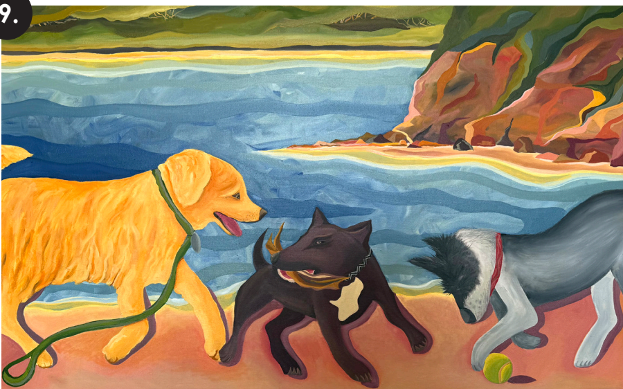
'Dog beach' | 122 x 81.5cm | $1500