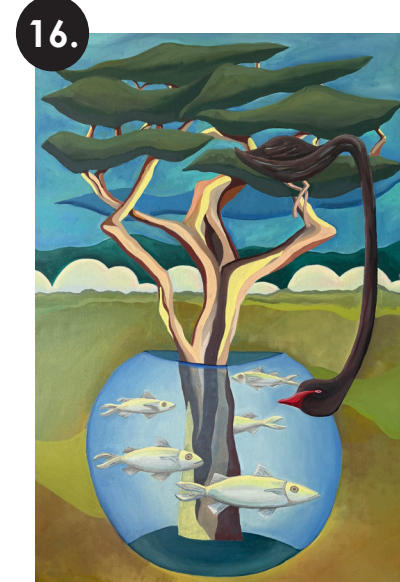
'Look both ways' | 61 x 91cm $1200