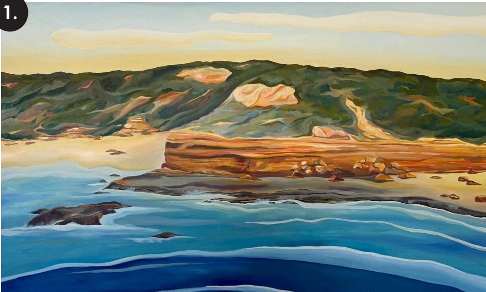
'Into Winki' | 152 x 91.5cm | $2500