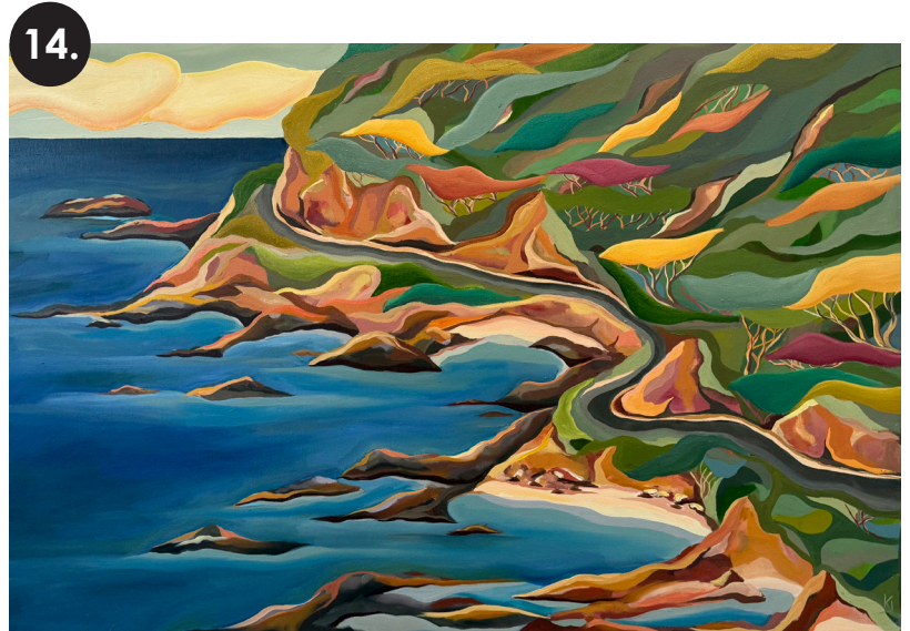
'Ocean Road' | 91 x 61cm | $1400