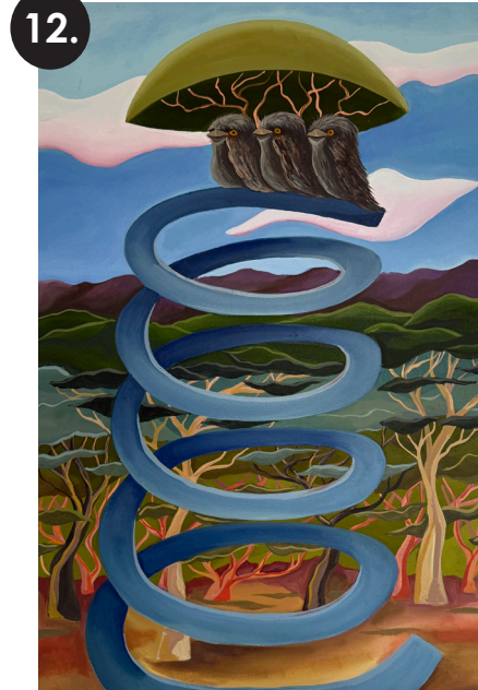
'Tawnys Spring Shelter' 51 x 76cm | $850