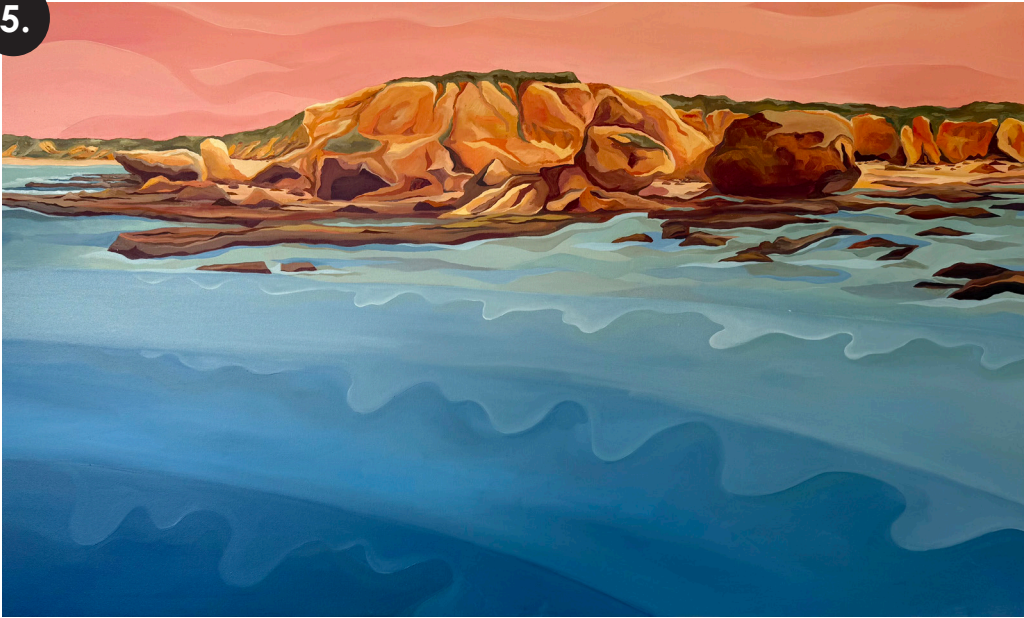
'Into Rocky Point' | 150 x 91cm | $2500