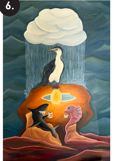
'HaHa you should have seen him paddle!' | 56 x 81cm | $850