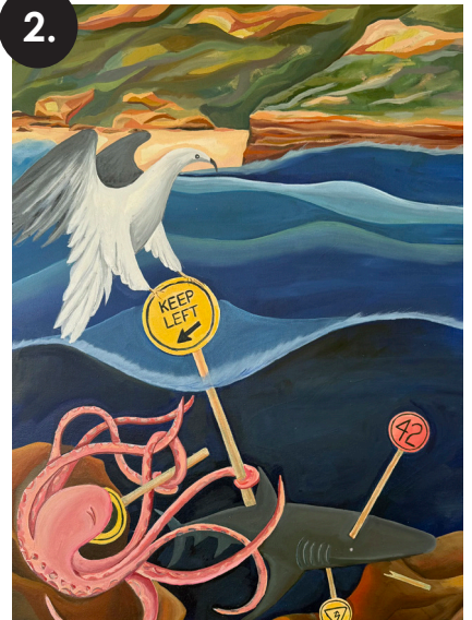
'42 below Winki' | 56 x 81.5cm | $850