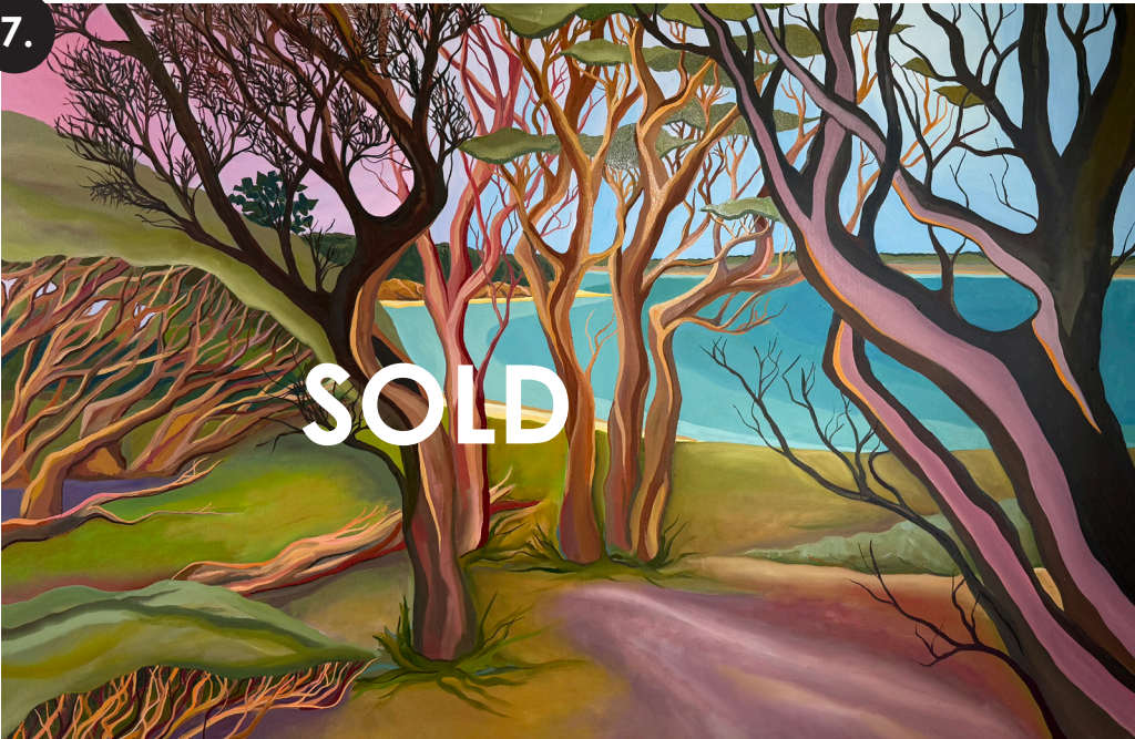
'Cosy at Cosy' | 153 x 102cm | $2600