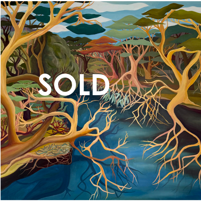
'The Creek' | 91 x 91cm | $1500