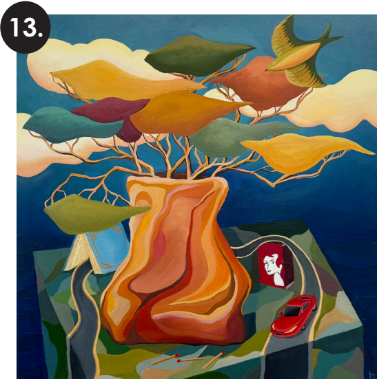
'Hot wheels hits the Ocean Road' 61 x 61cm | $850