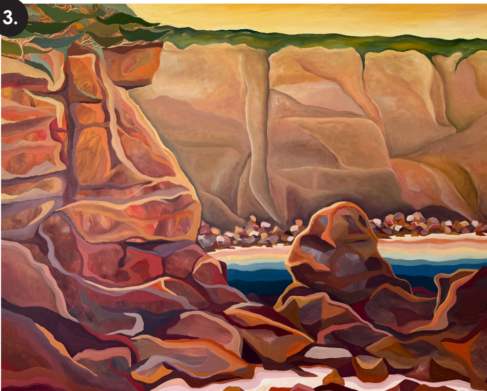
'Steps View' | 152 x 123cm | $3000